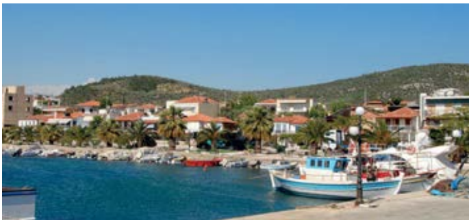
Skala Kallirachi harbour

The Apartments: Self Catering Apartments for 2/3 Air Conditioning Free Wifi