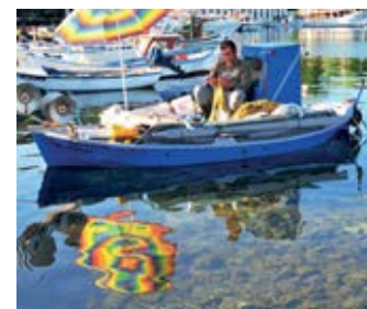
Thassos Town Old Harbour

In our view this is one of the nicest small units in Thassos Town.